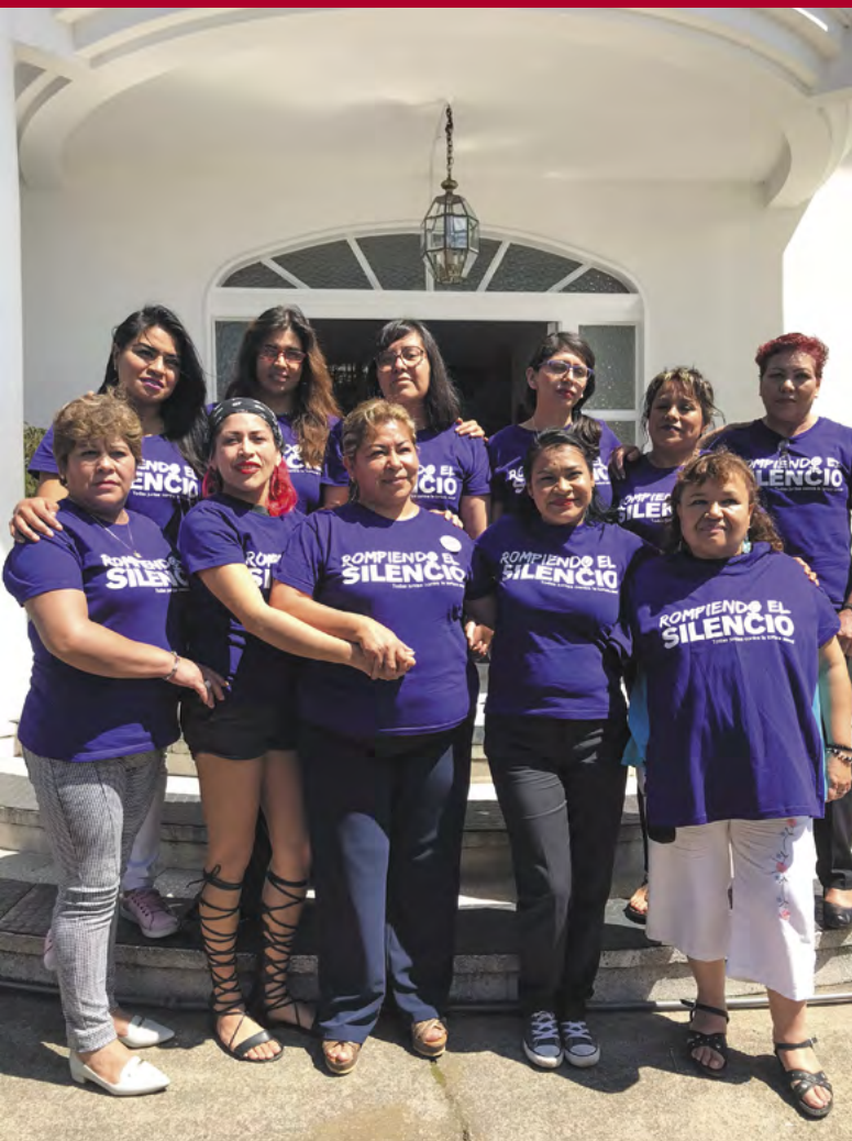
The 11 women litigating their case of sexual torture in San Salvador Atenco, outside the Inter-American Court of Human Rights in November 2017.