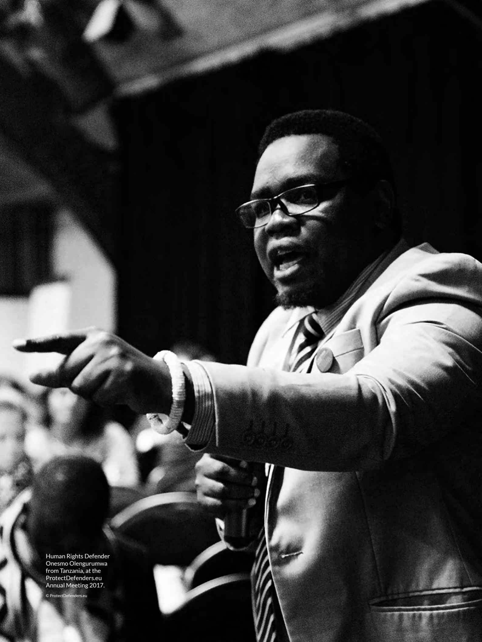
Human Rights Defender Onesmo Olengurumwa from Tanzania, at the ProtectDefenders.eu Annual Meeting 2017.