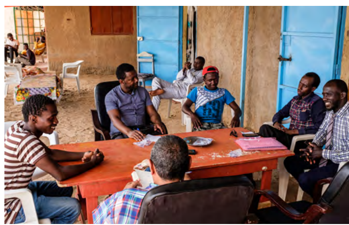
→ Mission to Niger ahead of the launch of the migration working group.

partner the Human Rights Commission of Pakistan. And in Mexico, various State authorities, civil society organisations and the Office of the UN High Commissioner for human rights drew up the first National programme to prevent and punish torture and other cruel, inhuman or degrading treatment or punishment. This Programme seeks to follow up on the implementation of CAT recommendations and to ensure that Mexico provides due consideration to the serious incidence of torture in the country.