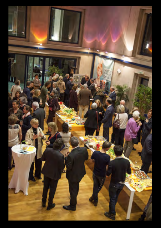
→ No less than 250 people came to our fundraising evening in Gland on 12 March.