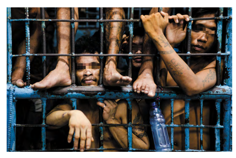
→ Severe overcrowding in detention is frequent in certain countries, like here in the Philippines.